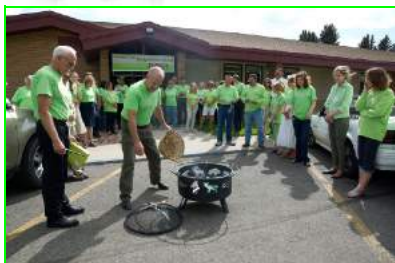
Burning Prayer Intentions after retreat!

MINISTERS FOR . . . Saturday, Aug. 4 th @ 5:00pm